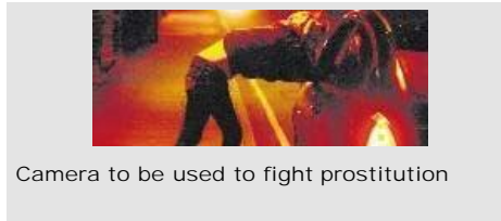
Camera to be used to fight prostitution